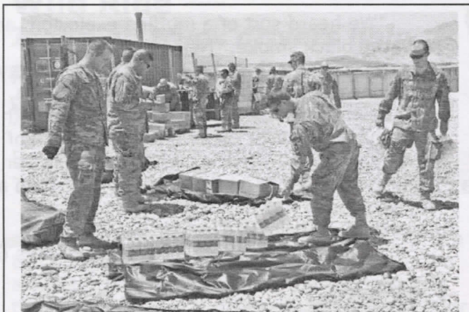
LAGHMAN PROVINCE, Afghanistan - Soldiers from the 1st Battalion, 133rd Infantry Regiment, Task Force Ironman, a part of the Iowa National Guard's 2nd Brigade Combat Team, 34th Infantry Division, Task Force Red Bulls, load speed balls, or quick resupply bags, May 25 at Forward Operating Base Mehtar Lam, Afghanistan.