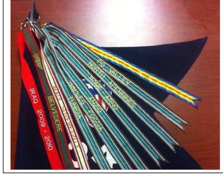
Page 6 Winter 2015