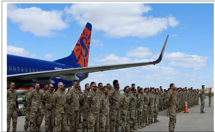
Soldiers of the 133 rd Infantry Battalion are formed up on the tarmac of the Waterloo Airport awaiting dismissal.

In Cedar Rapids approximately 130 Soldiers from Company B, 1-133d Inf Bn, were honored at a homecoming ceremony on April 9, 2021, at the Eastern Iowa Airport.