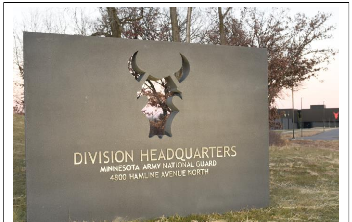
34 th Infantry Division Headquarters, Arden Hills, MN

The Division most recently deployed to provide command and control for Task Force Spartan in support of Operation Spartan Shield from 2018-2019.