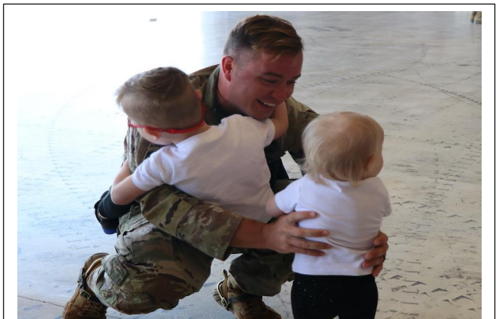
These guys are happy to see their Dad come home!

Approximately 90 Soldiers from Troop C, 1-113 Cavalry Regiment and 1-168th Infantry Regiment were honored at a homecoming ceremony on April 14, 2021. at the Sioux City Armory. Immediately following the ceremony, Soldiers were transported to the Le Mars Readiness Center where they were reunited with family members.