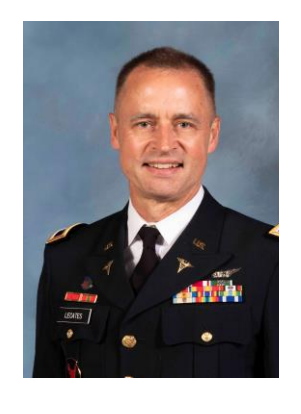
Page 4 Fall 2023